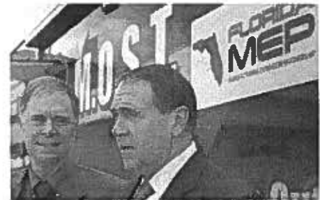
Arkansas governor and former presidential candidate Mike Huckabee, right, and state Sen. Bill Posey toured the Time Wise Mobile Outreach Skills Training unit Monday morning in Rockledge.

Mainstream Engineering makes "high-speed, high-efficiency compressors and turbines for air, steam, refrigeration and other chemical process applications," according to its Web site. It also makes thermal control systems and other components for spacecraft.